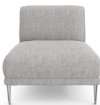
ACCENT CHAIR H W D AH SH SD SW FH 75 77 87 n/a 43 57 77 75